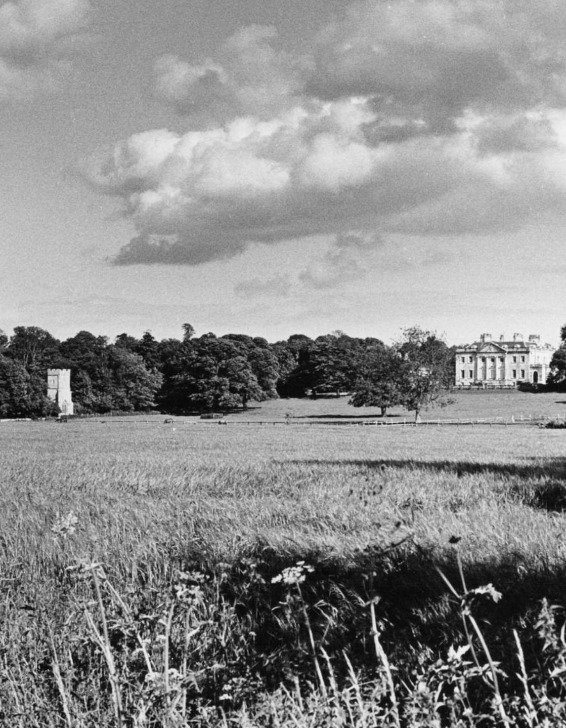
View from the north-west showing Came House