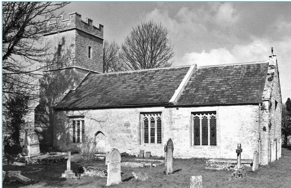
Exterior from the south

languages, music, wood engraving and historical studies, but is chiefly remembered for his published poems, most of which were written in the Dorset dialect and described many aspects of contemporary life in the county. He was greatly admired by Thomas Hardy, his near neighbour.