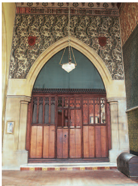
South aisle screen and stencilled wall decoration