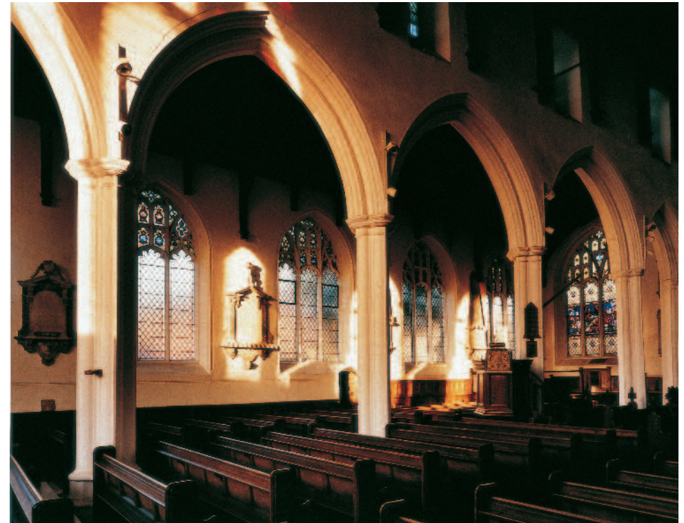
View through the arcade to the north aisle and chapel (Boris Baggs)

Near the entrance is a carved wooden dole cupboard , where bread was left for collection by the poor. Although restored in the 19th century, it bears the date 1675 and a rebus (a kind of pun) of a large 'Q' and a rat, for Curate, with his initials, and also mitred bishops