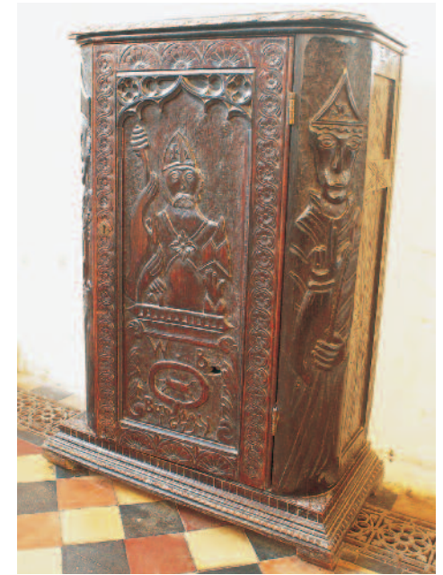
Right: The remarkable wooden dole cupboard of 1675 (Boris Baggs)

high-set east window above the sanctuary is the work of two glassmakers. The angels with musical instruments in the upper section are the work of J Powell & Sons, whilst the scenes below, of Our Lord's Baptism, Transfiguration, Crucifixion and Ascension are the work of E Baillie of London, given c. 1870 by the Revd G R Wales of Ditchingham in memory of his aunt.