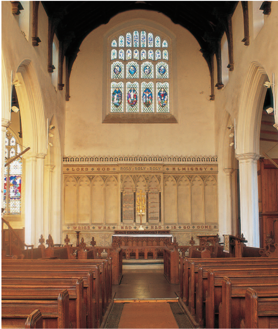
Left: Interior looking east with the high altar (Boris Baggs)