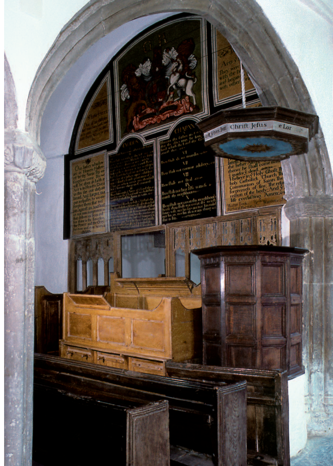
Right: Chancel screen and pulpit